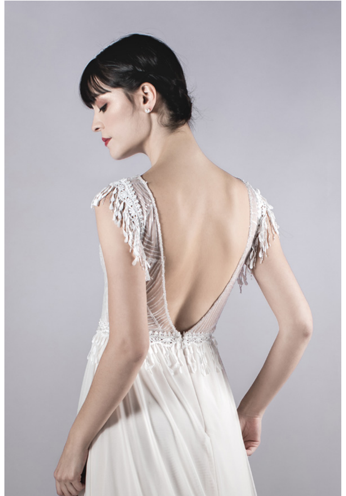
— NOELLE DRESS —