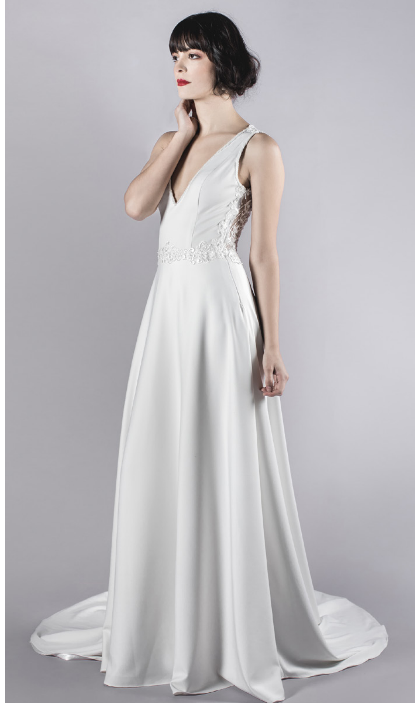
— ZOE DRESS —